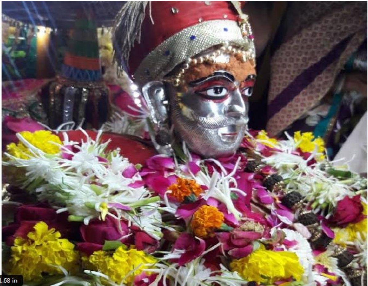
RAMESHWAR MANDIR OF VILLAGE MOTA