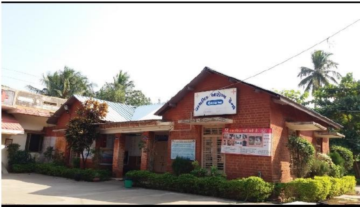
PRIMARY HEALTH CENTRE OF VILLAGE UMRRAKH

The importance of sustainable development also demands eco-friendly development of the villages and creations of appropriate employment opportunities locally.