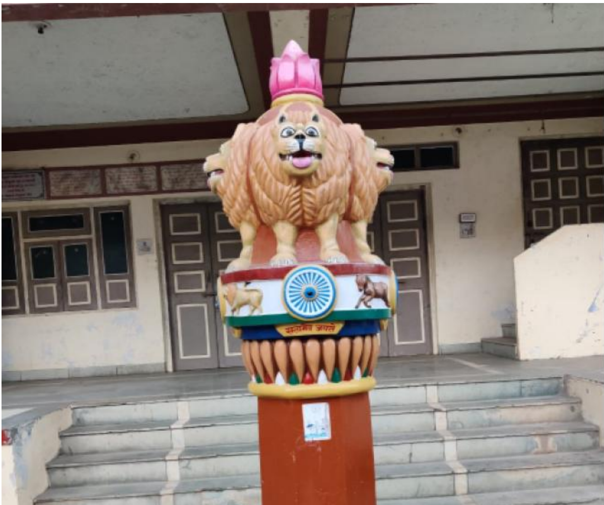
HISTORICAL MONUMENT OF VILLAGE ASTAN

As foreseen by Father of the Nation, Gandhi Ji, western developmental model, based on centralized technologies and urbanisation has given rise to serious problems like increasing inequality, leading to crime and violence, and climatic changes due to rapid ecological degradation.