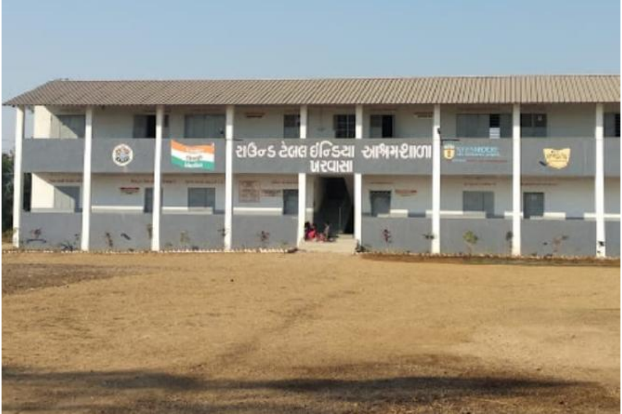
MONUMENT OF KHARVASA